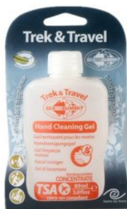
Trek & Travel LIQUID HAND SANITIZER 89ML