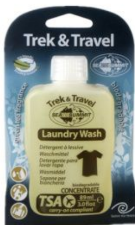
Trek & Travel LIQUID LAUNDRY WASH 89ML